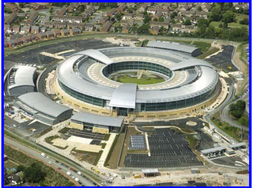
Sustainable Design →